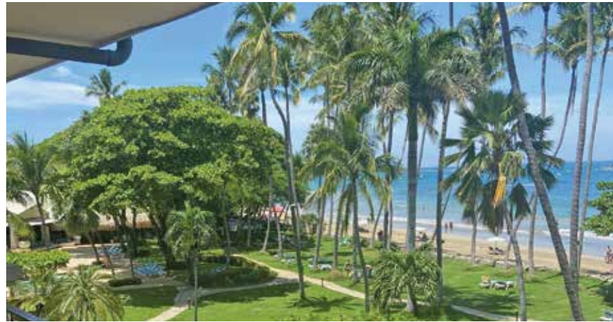
BEACH BUM – Palm trees, nicely manicured landscaping and a pristine beach hug the blue waters of the Caribbean Sea in Costa Rica.

We flew into Liberia airport and stayed at the Secrets Papagayo Resort – a stunning all-inclusive property with lush gardens on the gulf. The resort is large and hilly with a black-sand beach. It's a great getaway for clients who want an adult-only resort. It's a large spread-out property, not suitable if you have mobility issues. We also toured the nearby