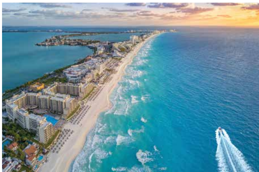
YES YOU CAN – Luxurious resorts line the coast, waiting to entertain guests in Cancun.

Cancun boasts 12 miles of beach that snuggle with turquoise waters and white sand. All are open to the public and make for a perfect walk. Guests can hike along the northern shore by the calming waters of Bahia de Mujeres or follow the Caribbean Sea on the eastern shore. Sand shares the appearance of talcum powder and doesn't