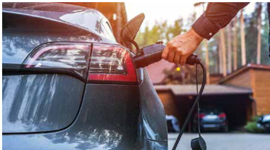
PLUG IT IN – Hertz plans to have 2 million electric vehicles available to customers by the end of this year.

A recent survey by Verra Mobility found that 78% of Americans would consider renting an EV to become more familiar with the car before making a purchase.