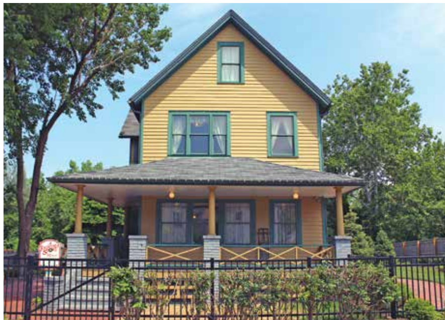
STORY TIME – Fans can visit the house from the classic holiday hit "A Christmas Story" in Cleveland.

The hidden gem, however, is the Parker home. The coal-dust-spewing domicile is intimate and old-fashioned. Spigots are built into the walls of the kitchen sink. The radio plays "Little Orphan Annie" and the family makes fond memories inside this