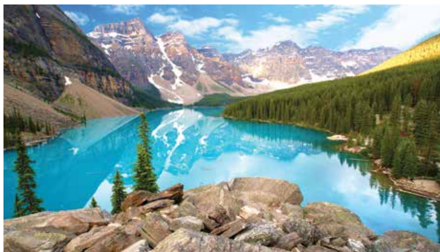
MASTERPIECE – The Canadian Rockies reflect off Moraine Lake in western Canada.

The Banff Gondola sends passengers on an eight-minute ride to the summit of Sulphur Mountain. Marvel at 360-degree views of Banff, the Bow Valley and six scenic mountain ranges