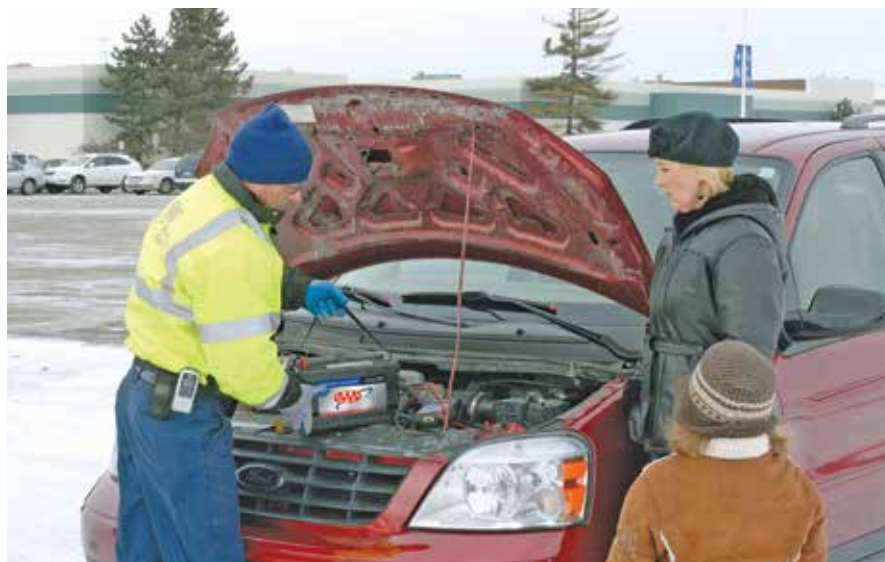
HOLDS A CHARGE – AAA batteries have 36-month, free-replacement nationwide warranties.

electricity to control multiple onboard computers and powertrain features, such as stop-start technology, heated seats, wireless hotspots and video displays that keep the vehicle running smoothly. Reduced hours of daylight result in more use of headlights and heating – all of which take tolls on the battery's power reserve.