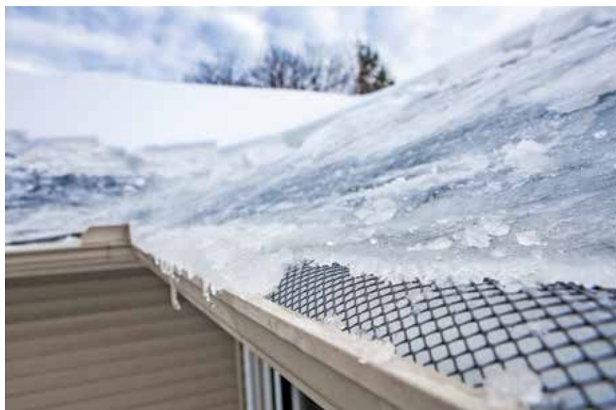
WINTER PROBLEM – Ice dams form in a gutter, potentially causing serious damage to the home.

the use of soffit and ridge vents to help circulate air through the attic, ensuring a consistent temperature.